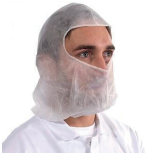
Face Snood Cover

We ensure the safety of workers and the processed food to clean. All of our disposable hygienic consumables are made with care to ensure hygienic packaging. UNIVERSE CO. develops, produce, market and sell value-added hygiene products and services. Minimizing risk of food safety problems during and after processing to increase the productivity.