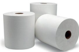
Maxi Roll 1 Ply, 2 Ply