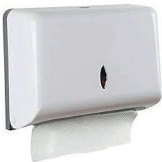
Interfold tissue dispenser