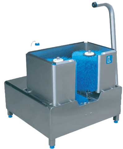
GUMBOOT WASHING STATION