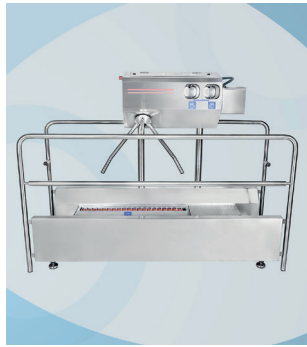
EDT-TY-100 Hygiene Barrier with Hand Disinfectant Turnstile and Sole Cleaning Brushes