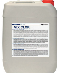
VIXCLOR Alkaline Chlorinated Foam Chemical ITEM CODE - VO1 PACK SIZE - 28L BRAND - PROQUIMIA COUNTRY OF ORIGIN - SPAIN