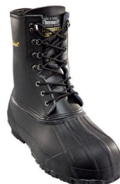
Freezer Safety Shoes