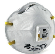
N95 Particulate Respirator