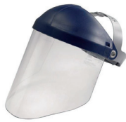
Safety Face Shield