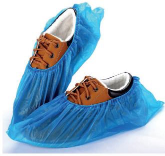
PE Shoe Cover