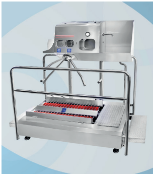
COMPACT-TAF Compact Hygiene Barrier with Sink, Jet Dryer, Hand and Sole Disinfectant