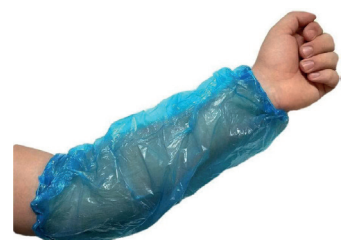
PE Arm Sleeves