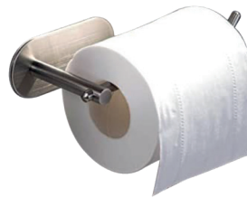
Toilet Roll Jumbo