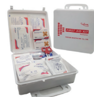
First Aid Box