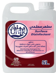
UNIK SURFACE DISINFECTANT PACK SIZE - 4x5L ITEM CODE - UO2 BRAND -UNIVERSE COUNTRY OF ORIGIN - KUWAIT