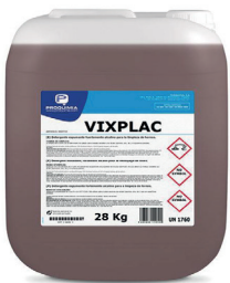
VIXPLAC Degreaser & Oven Cleaner ITEM CODE- VO2 PACK SIZE - 28L BRAND - PROQUIMIA COUNTRY OF ORIGIN - SPAIN