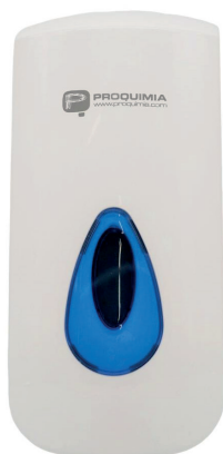
HAND SOAP / SANITIZER DISPENSER LIQUID / GEL / FOAM