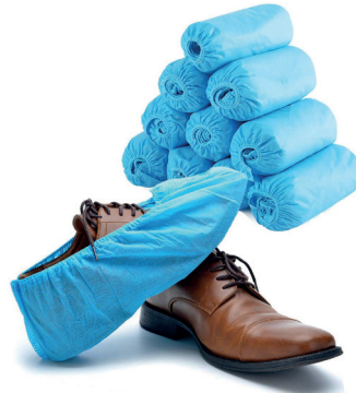
Non-Woven Shoe Cover