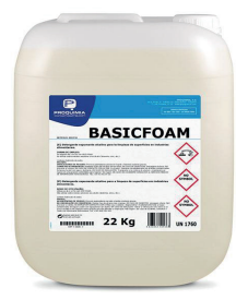
BASICFOAM Degreaser & Oven Cleaner ITEM CODE - B01 PACK SIZE - 22L BRAND - PROQUIMIA COUNTRY OF ORIGIN - SPAIN