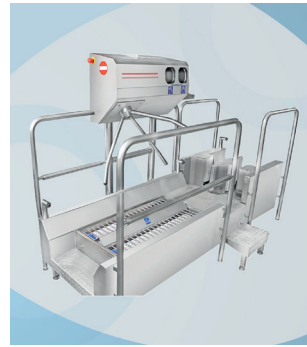
EDT-TYC-100 Hygiene Barrier with Hand Disinfectant Turnstile, Boot & Sole Cleaning Brushes