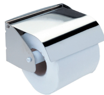
Toilet tissue roll dispenser