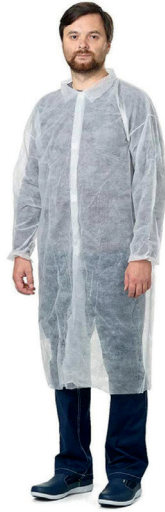
Non-Woven Lab Coat