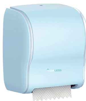
Auto cut dispenser