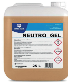
NEUTRO-GEL Wash Up Liquid ITEM CODE - N01 PACK SIZE - 25L BRAND - PROQUIMIA COUNTRY OF ORIGIN - SPAIN