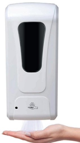
SENSOR HAND SOAP / SANITIZER DISPENSER LIQUID / GEL