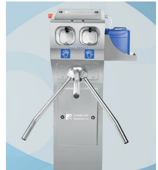
SA-EY Ground Mounted Hand Disinfectant Turnstile