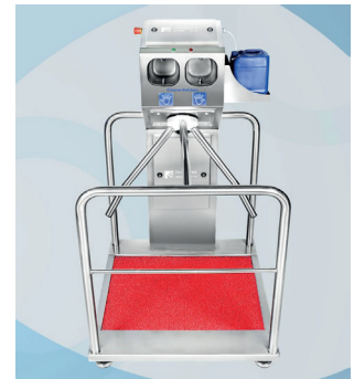
PORTATIVE Portable Hygiene Barrier