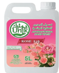
UNIK ANTIBACTERIAL HAND WASH GEL / FOAM ITEM CODE- U04 FRAGRANCE - MULTI FLAVOUR PACK SIZE - 4x5L BRAND - UNIVERSE COUNTRY OF ORIGIN - KUWAIT