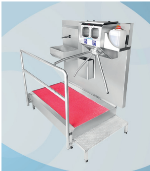
EPSET Sink, Hand Disinfectant Turnstile, and Hygiene pool with Mat