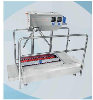
EKO-EDT-TY-100 Hygiene Barrier with Hand Disinfectant Turnstile and Sole Cleaning Brushes