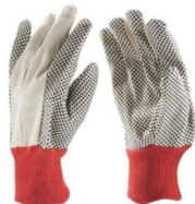
Cotton Dotted Gloves