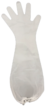
Non-Woven Arm Sleeves