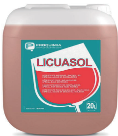
LICUASOL Dish Washing Detergent ITEM CODE - L01 PACK SIZE - 20L BRAND - PROQUIMIA COUNTRY OF ORIGIN - SPAIN

Sustainability is a fundamental part of UNIVERSE strategy. Our capacity for innovation allows us to supply the chemical solutions that respect the planet and have a low impact on the environment.