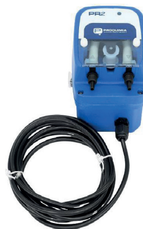
Dosing pump for detergent PR-2 deterg-220v