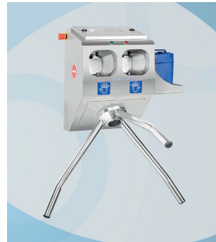
SA-ED Wall Mounted Hand Disinfectant Turnstile