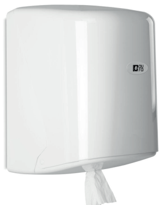
Maxi roll tissue dispenser

Our industrial hygiene and cleaning systems are extremely efficient, low maintenance and easy to operate. We supply solutions that clean, foam or disinfect your premises. Our systems are designed to be as practical as possible.