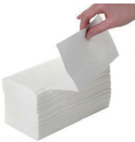
Interfold Tissue 1 Ply, 2 Ply