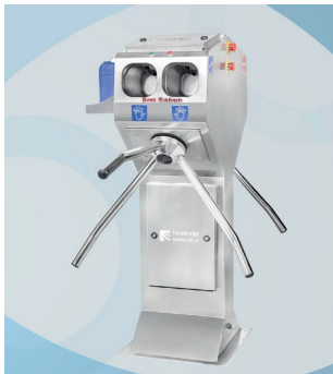
Double Side Turnstile