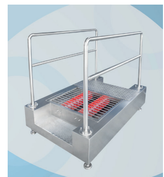
SA T 70 Sole Washing Hygiene Barrier