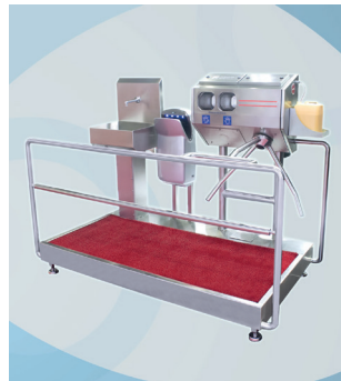
SA-EPE Hygiene Barrier with Sink, Jet Dryer, Hand Disinfection Device with Turnstile and Pool with Mat