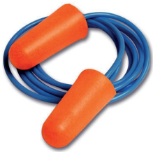
Safety Ear Plugs