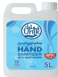
UNIK HAND SANITIZER PACK SIZE - 4x5L ITEM CODE - UOB BRAND - UNIVERSE COUNTRY OF ORIGIN - KUWAIT