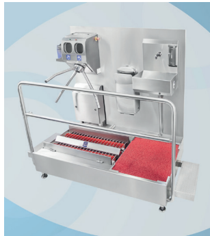
FEPSET Hygiene Barrier with Sink, Mat, and Hand Disinfection Device with Turnstile and Sole Cleaning Brushes