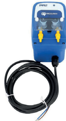
Dosing pump for rinse aid PR-2 abril