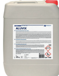
ALUVIX 25L Chlorinated Alkaline Detergent ITEM CODE - AO2 PACK SIZE - 25L BRAND - PROQUIMIA COUNTRY OF ORIGIN - SPAIN