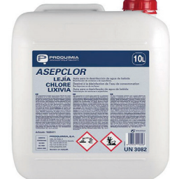
ASEPCLOR Food-Grade Bleach & Surface (Disinfectant) ITEM CODE A04 PACK SIZE - 10L BRAND-PROQUIMIA COUNTRY OF ORIGIN - SPAIN