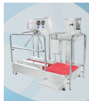
SA-EFE Hygiene Barrier with Sink, Mat, and Hand Disinfection Device with Turnstile and Sole Cleaning Brushes