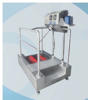
SA ET 70 Hand Disinfectant and Sole Washing Hygiene Barrier