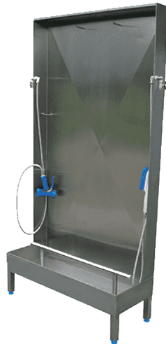
APRON WASHING STATION