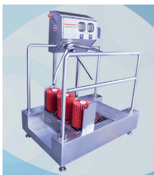
G 70 Hand Disinfectant, Sole and Boot ash Hygiene Barrier SA-T Brushes