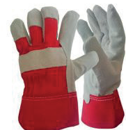
Freezer Safety Gloves