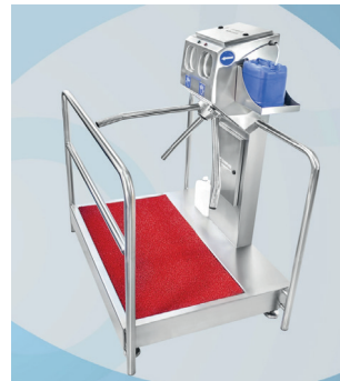
PET Hand Disinfectant With Turnstile & Hygiene Pool