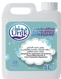
UNIK MULTIPURPOSE DETERGENT PACK SIZE - 4x5L ITEM CODE U01 BRAND- UNIVERSE COUNTRY OF ORIGIN - KUWAIT