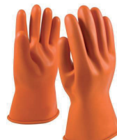
Reusable Rubber Gloves