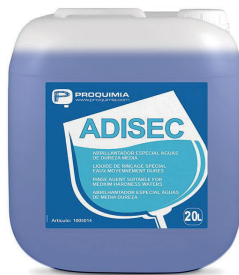
ADISEC Rinse Aid ITEM CODE - A01 PACK SIZE - 20L BRAND - PROQUIMIA COUNTRY OF ORIGIN - SPAIN